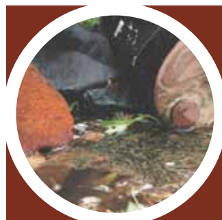
Oil pollution from discarded containers

River pollution can have various causes and symptoms