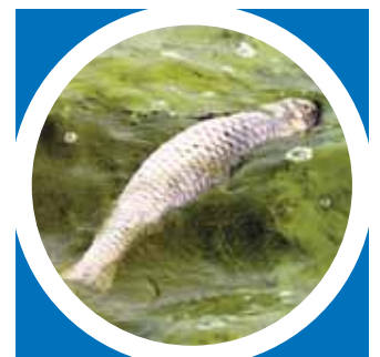
Dead fish can be a sign of a pollution incident